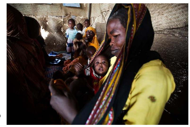
Women and children at a nutrition Centre in North Darfur

On 23 October, the European Commission announced in a press release a €106 million (about US$ 123 million) donation for humanitarian and development assistance to help people affected by displacement. malnutrition. disease outbreaks and recurrent extreme climatic conditions in Sudan. Of this amount, €46 million (about $54 million) will go towards humanitarian assistance and €60 million (about $70