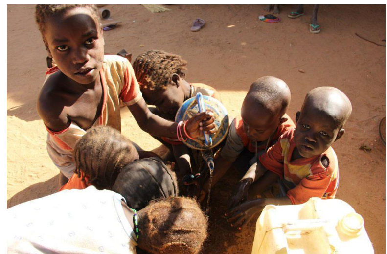
Sudanese refugee children in Chad (WFP, 2016)

In Chad, Sudanese refugees face dwindling humanitarian support, with cuts to food rations and limited livelihood