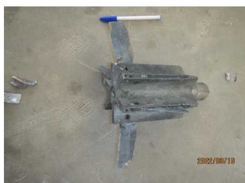
Remnant of the 120mm tank round that hit the home of the al-Amour family at about 3.55pm on 5 August 2022

She added: “When we heard the bullets fired from the border, we fled to a nearby house and afterwards we saw that they’d hit the Al-Quds Brigades’ tower and minutes later we heard the afternoon call to prayer.”