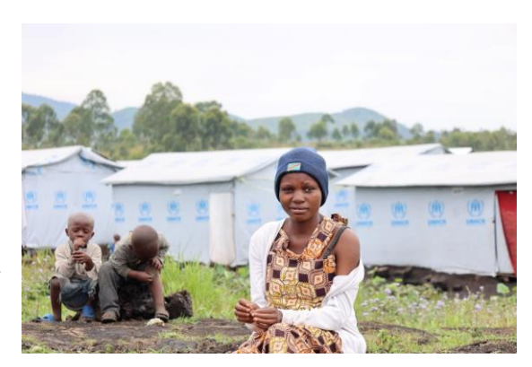
Displaced family at the Bushagara IDP site, in North Kivu, DRC.

Context : As of February 2023, southern Africa was home to 8.4 million forcibly displaced people and refugee returnees. The region comprises the largest IDP situation in sub-Saharan Africa, while refugee camps and settlements in multiple countries, along with some urban areas, host long-term refugee populations – some displaced for many decades. Complex crises cause millions to flee their homes and prevent their safe return. The situation is further complicated by the growing impact of climate change and natural disasters .