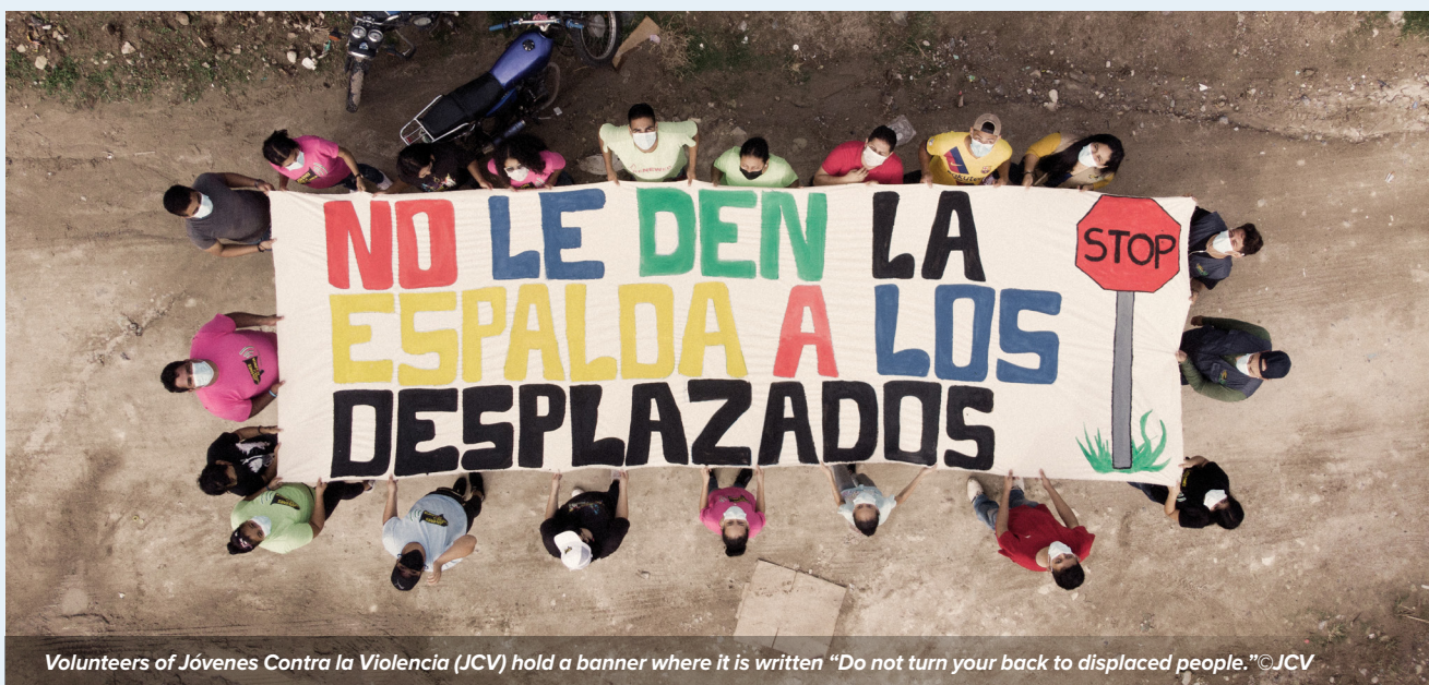
Volunteers of Jóvenes Contra la Violencia (JCV) hold a banner where it is written "Do not turn your back to displaced people."

UNHCR supports the design of mechanisms to regulate the law and its implementation as quickly as possible. The work is carried out together with national institutions of human rights and the ombudsperson such as the Secretariat of Human