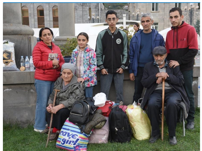
Refugees have just arrived at the reception center in Goris, tired from the three-day journey on the road. 28 September 2023. Goris, Syunik province.

Response: UNHCR scaled up its operation to respond to the urgent lifesaving needs of refugees and facilitate the coordination of the humanitarian response together with the Government. So far, 5,500 individuals were supported with cash assistance, 6,724 households (29,818 individuals) reached through core relief items, 2,291 households (10,473 individuals) reached through protection interventions, and 4134 individuals reached through helpline.